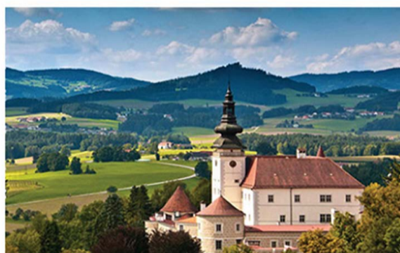
Reichenthal Castle, Austria

Annual event in Muhlviertel, the upper province of Austria, north of the Danube. Walks, hikes, tours, in the traditional towns and villages... more